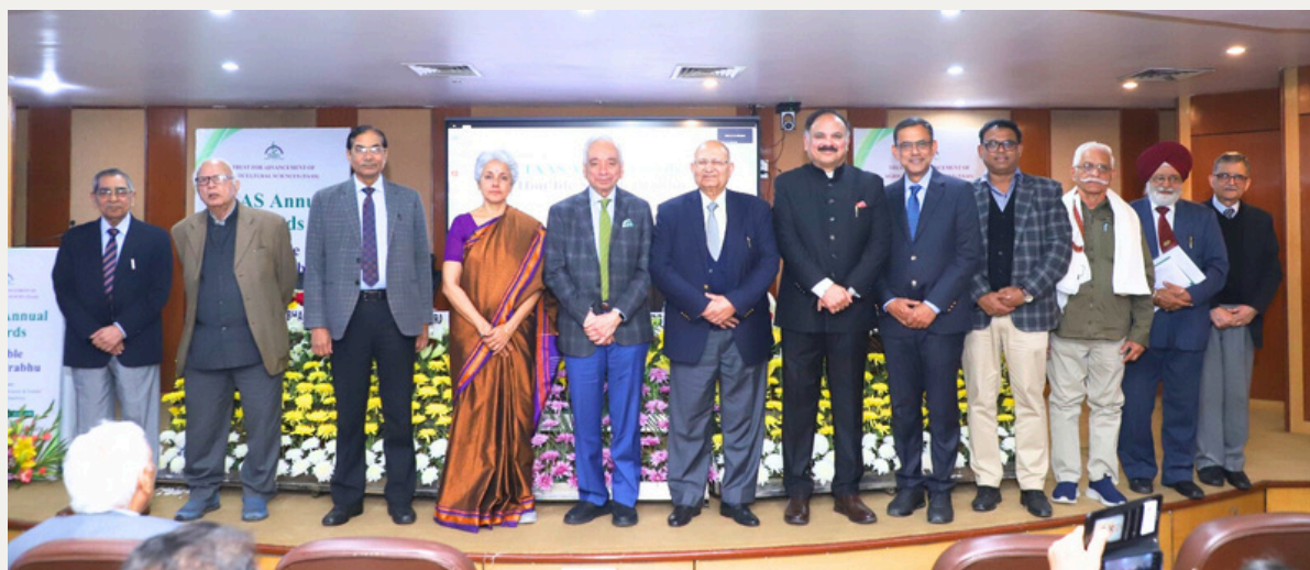
Awardees of Dr MS Swaminathan award, Dr SK Vasal Award for excellence in Crop Hybrid Research & Dr Norman E Borlaug innovative farmer award